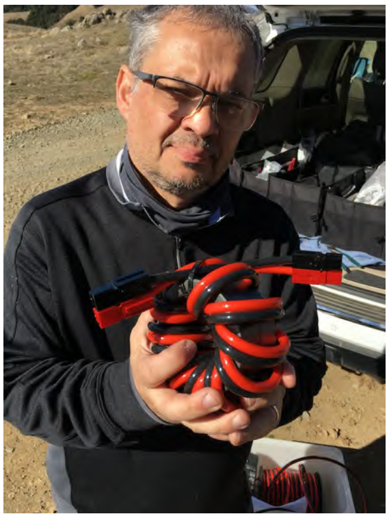
W6TCP holding the high-current battery choke.