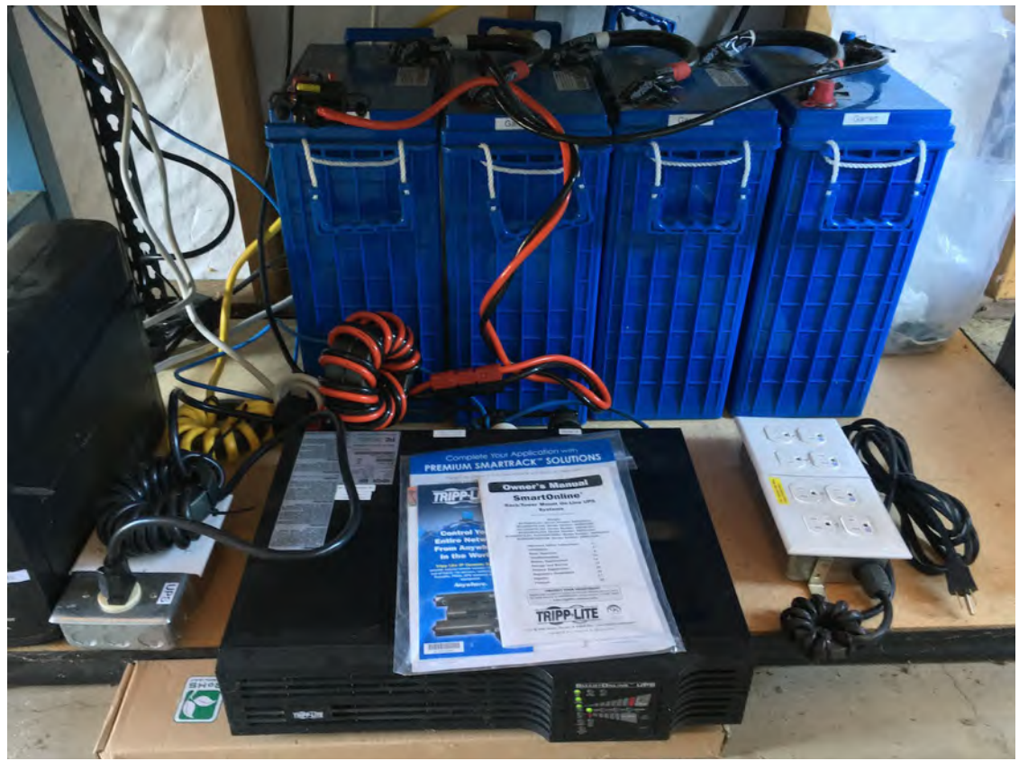
The second UPS installation, with all filtering devices visible.