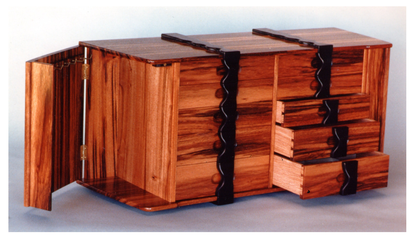
I designed this jewelry box on a commission from my girlfriend's mother in 1990. It is the finest thing I've ever built, and is clearly a masterpiece. The primary wood is Goncalo Alves from the tropics of South America, and the details are Gabon Ebony. Drawer sides are red oak. Finish is Tung oil. It took me 260 hours, and I'm not sure I have the eyes to do such a piece again!