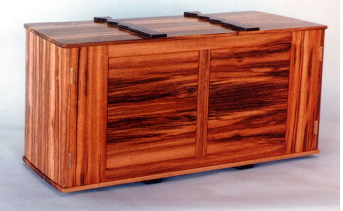
You can see the continuous grain on the drawers; the top and bottom also have pleasing grain lines since all parts were resawn from one large plank and then bookmatched. End doors are coopered to form a gentle curve. The back is frame-and-panel.